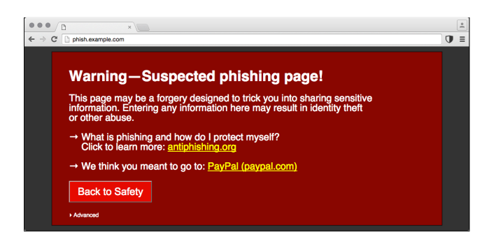
Fig. 2. Example of actively preventing a user from accessing a phishing site.

2) Anti-Phishing User Interfaces: User interfaces in antiphishing tools play an important role in determining whether a user clicks on phish after it has been detected. There is the need for clear, non-subtle visual indicators of security problems [10]. Zhang et al. [28] found that while some user