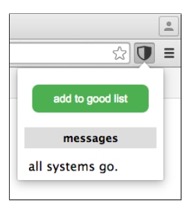
Fig. 1. Users click the "Personalize Button" on websites to add to whitelist of known-good sites.